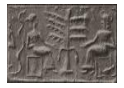
The Temptation Seal