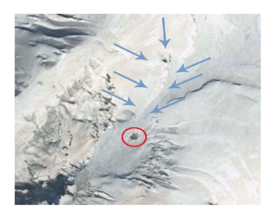
Noah's Ark Covered With Snow & Embedded In A Glacier

So then, the Bible is not mythical, but it has events that can be proven to have happened by sources of information outside of the Bible.